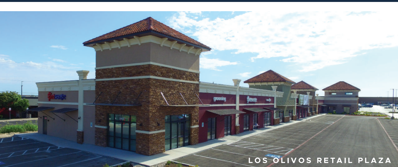
LOS OLIVOS RETAIL PLAZA