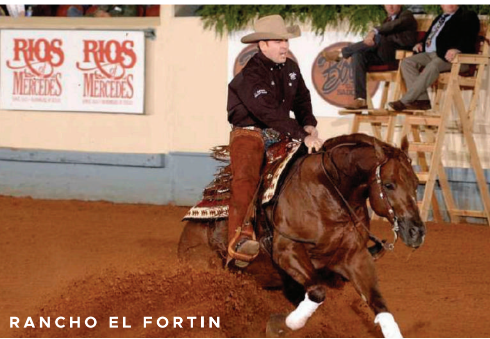
RANCHO EL FORTIN