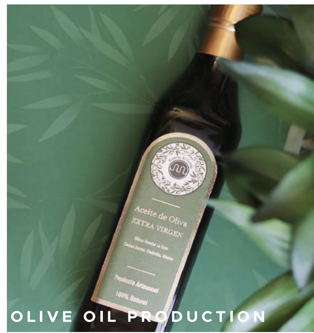
OLIVE OIL PRODUCTION

REAL ESTATE DEVELOPMENT • CONSTRUCTION • LOGISTICS